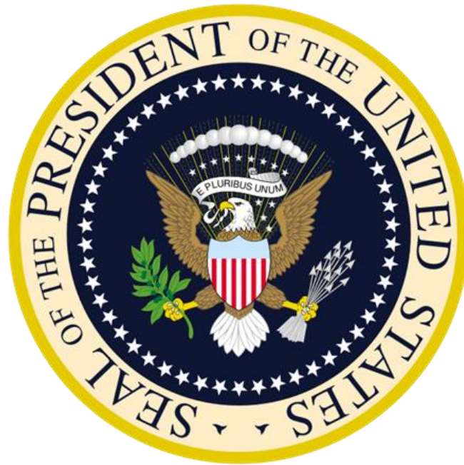
Seal of the President of the United States