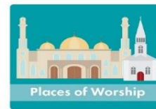
Places of Worship

Schools (all levels from preschool through college, also vocational and trade schools)