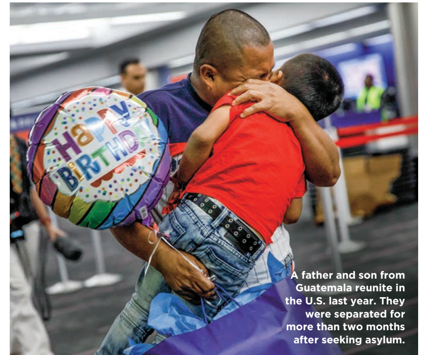
A father and son from Guatemala reunite in the U.S. last year. They were separated for more than two months after seeking asylum.

But critics say the new rules won’t necessarily stop separations. Plus, officials will be able to detain separated kids for far longer than what was legal before. Nineteen states are suing the administration to stop the rules from going into effect. In addition, the ACLU and other groups have filed lawsuits against the government to make sure family separations truly end.