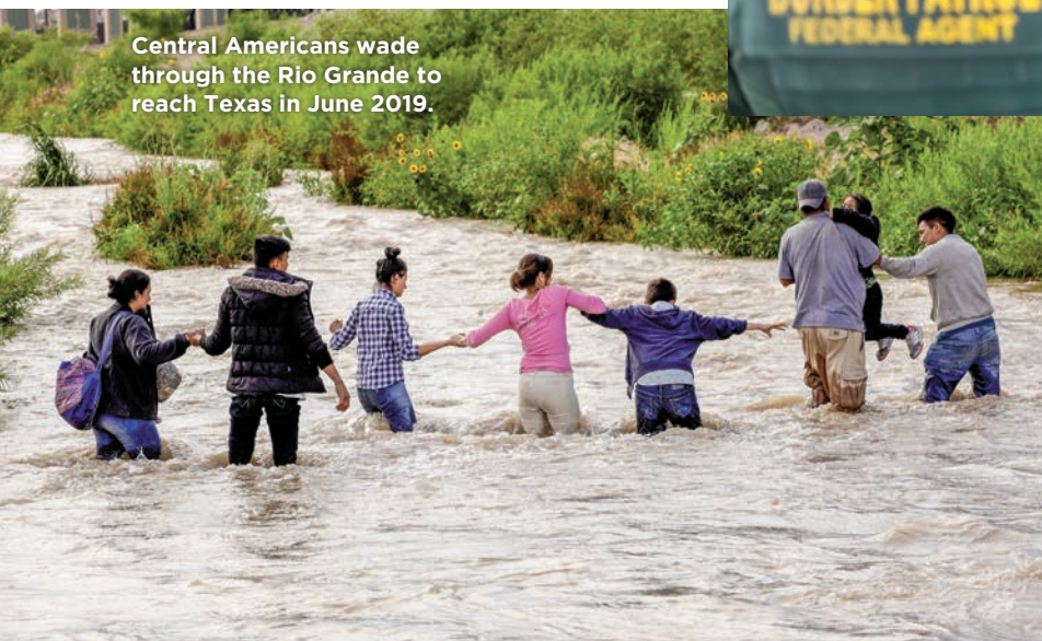
Central Americans waded through the Rio Grande to reach Texas in June 2019.