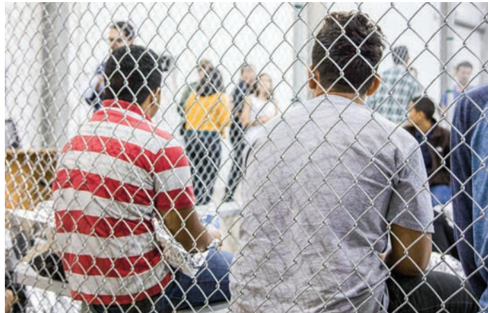
Immigrant children and adults await processing at a U.S. Customs and Border Protection facility in McAllen, Texas, last year ( above and at right ).

Most of these immigrants are from Guatemala, Honduras, and El Salvador. Those three Central