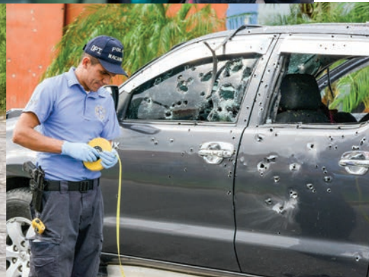
Above: A police officer in Honduras. Like Guatemala and El Salvador, the nation is plagued by gang violence.

and the Trump administration’s stricter policies—has overwhelmed the U.S. immigration system.