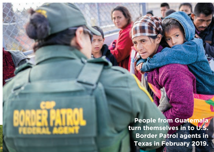
People from Guatemala turn themselves in to U.S. Border Patrol agents in Texas in February 2019.

—12-year-old girl from Ecuador, detained in Texas